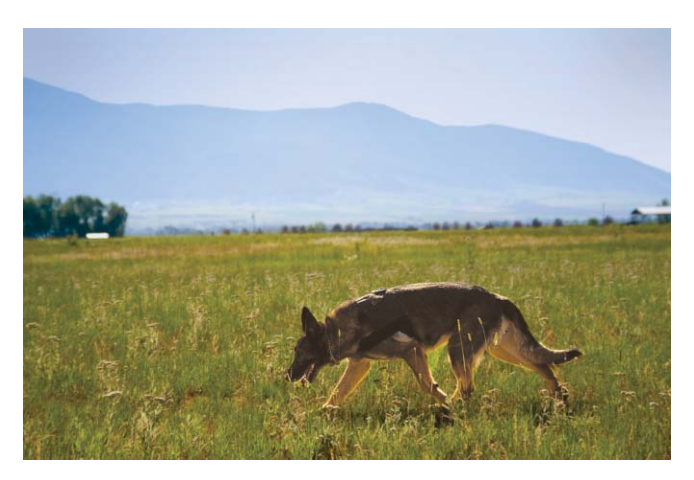
Figure 4. Search dogs can thoroughly cover large areas and detect obscure, low-density plants better than human surveyors. "Nightmare" searches for the odor of spotted knapweed in a dryland pasture near Bozeman, Montana.

While the cost of prevention is paid in the present, its benefits lie in the future. Therefore long-term measures of success are optimal and include comparing future inventories to baselines to determine if strategies were effective over time. Prevention would be considered effective if high-risk sites remained weed-free and ineffective if new weeds establish and persist.