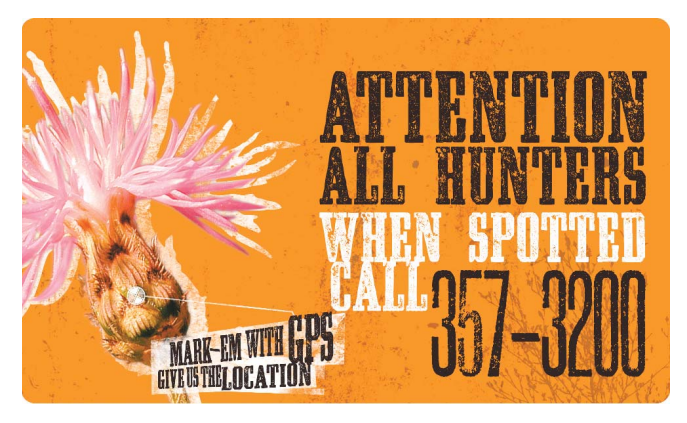
Figure 3. Call-to-action programs encourage hunters to report new invasions of spotted knapweed in eastern Montana to local weed departments.

populations in remote areas. Using light utility helicopters (e.g., Hughes 500 model) that can travel slowly (about 12 miles per hour) and close enough above the ground (about 50 feet), trained observers can visually discriminate weed patches in vegetation, even when the colors of both are similar, and map them with mobile GIS. DASM is a useful method to quickly and regularly search remote or inaccessible sites, especially near the advancing front of wind-dispersed plants having high survival rates, such as rush skeletonweed, which occupies regions adjacent to eastern Montana.