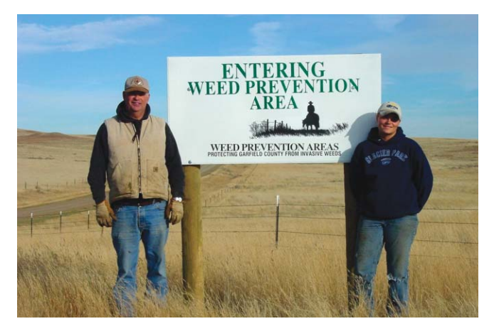
Figure 2. Weed prevention area signs mark weed-free areas and educate visitors.

Determining which plants to target for prevention begins with stakeholder meetings. Field ecologists, county weed